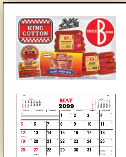
A417 & A117 size 20" x 26"