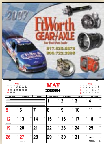
A422 (oversized shown) size 17" x 22"