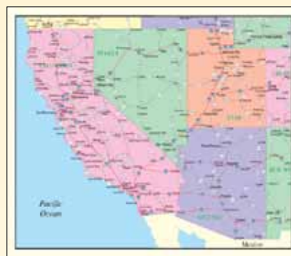
VPP1MP: 2 of 16 page Color Map included.