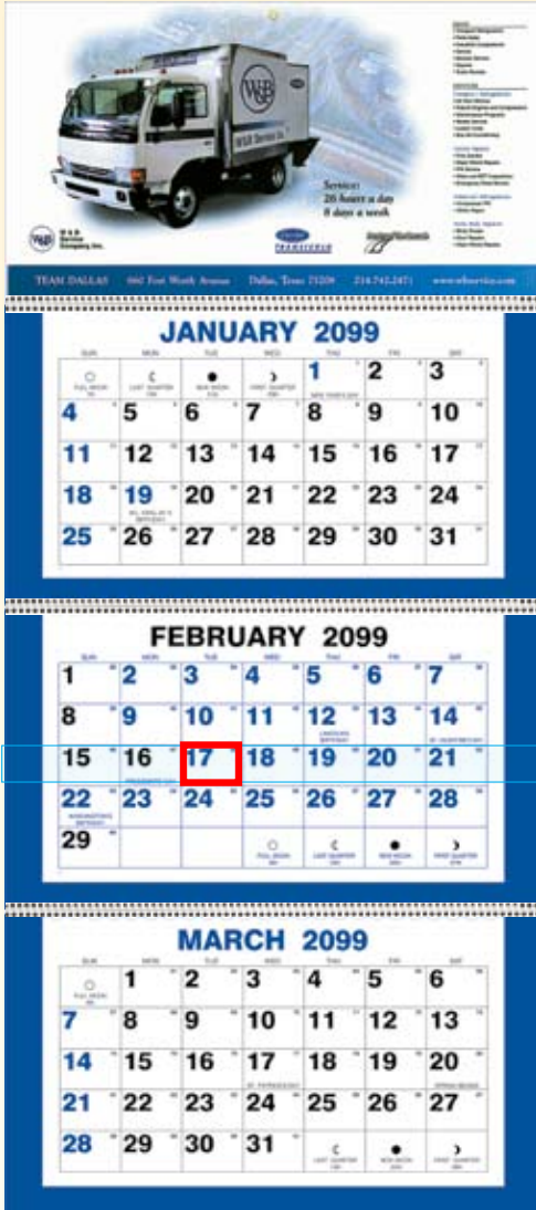
TY16 (WIRE-O BOUND) size 16" x 36"

NEW! WIRE-O BINDING +60¢(G) per calendar