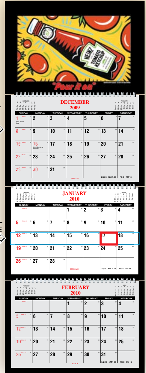
TY12C size 12" x 32" WIRE-O Binding shown / Black Panels shown