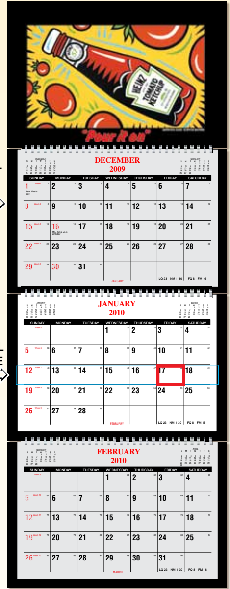
TY12C size 12" x 32" WIRE-O Binding shown / Black Panels shown