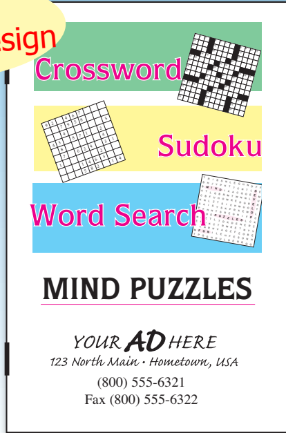
CB2 Stapled 5.5"x8.5"