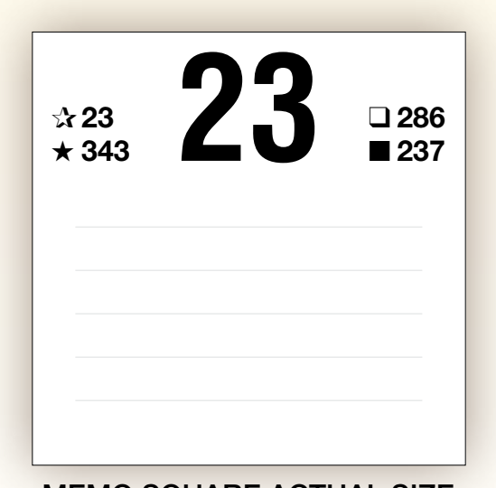
MEMO SQUARE ACTUAL SIZE