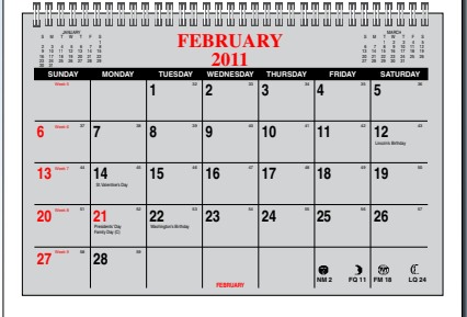
I-12 12"x32" 3 Month At Glance 1 Image