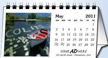
I-55 12 Images 5.5" x 3"