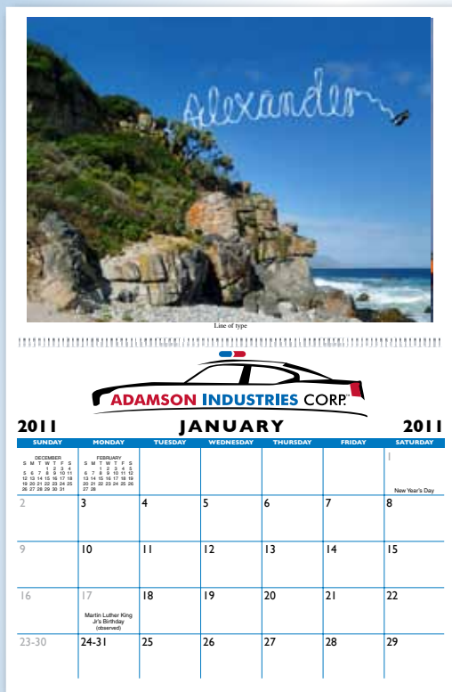
I-17 11" x 17" 12 Image