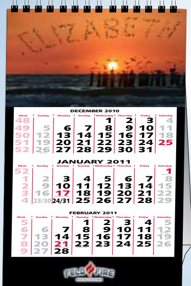
I-V1 12 Images 5.5" x 8.5"