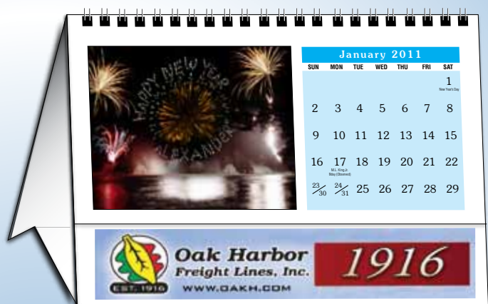
I-411 12 Image Tent 8.5" x 4.25"