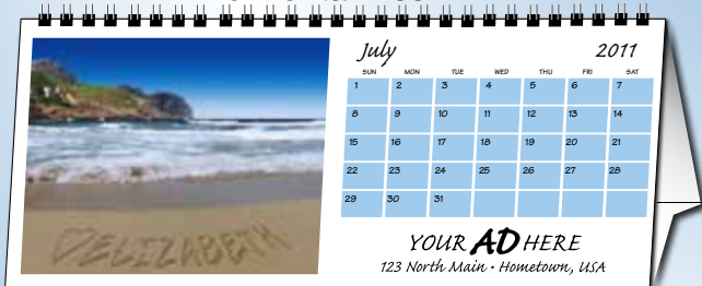
I-1144 12 Images 11" x 4.5" (24 pages printed both sides) I-1140 12 Images 11" x 4.5" (24 pages printed one side)