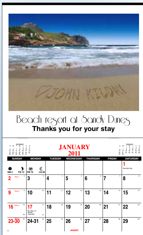
I-7 11" x 17" 1 Image